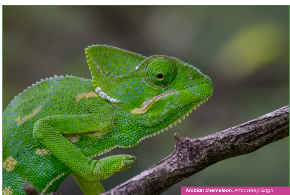
Arabian chameleon