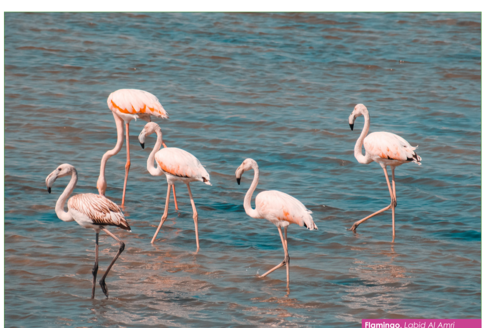
Flamingo, Labid Al Amri