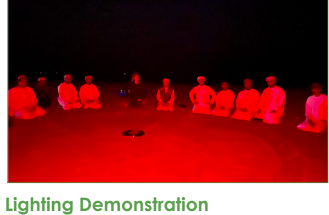
Event: Raising Awareness On October 1st, ESO hosted a Lighting

Sawadi Beach provided a crucial opportunity for scientists to collect data and samples for conservation management. Led by the Environment Authority, the effort brought together veterinarians from Yas SeaWorld Research & Rescue Center, alongside ESO, Future Seas Global SPC, and One Oceans LLC. The Royal Oman Navy and Police managed crowds and removal, while Al Mussanah Municipality oversaw disposal, and Sultan Qaboos University is analyzing samples. This collaboration between government entities, NGOs, consultants, and international partners highlights the power of collective action in marine conservation.