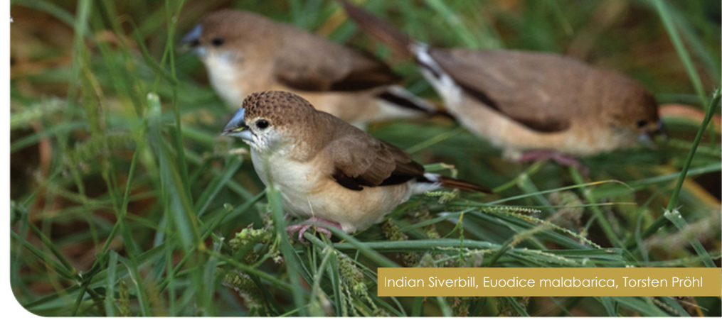
Indian Siverbill, Eudice malabarica , Tarsten Pröhl