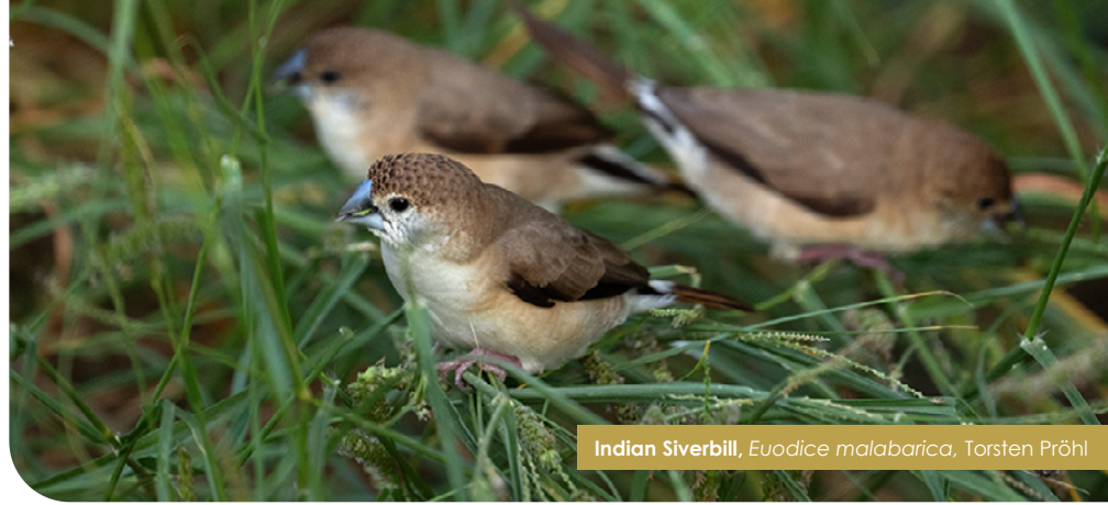
Indian Silverbill, Eudice malabarica , Tarsten Prohl