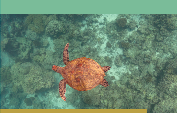
Green Turtle ( Chelonia mydas ), Paul Flanaherty

ESO Annual Report 2024 now available on our resources page