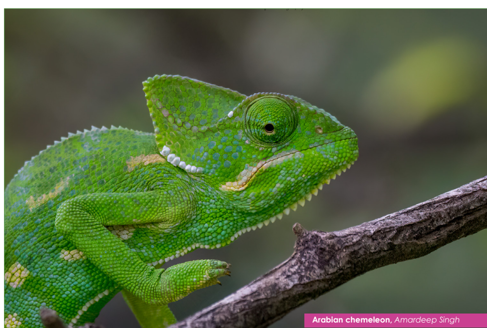
Arabian chameleon