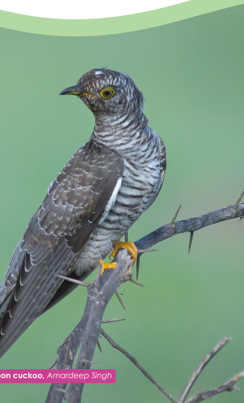
Common cuckoo