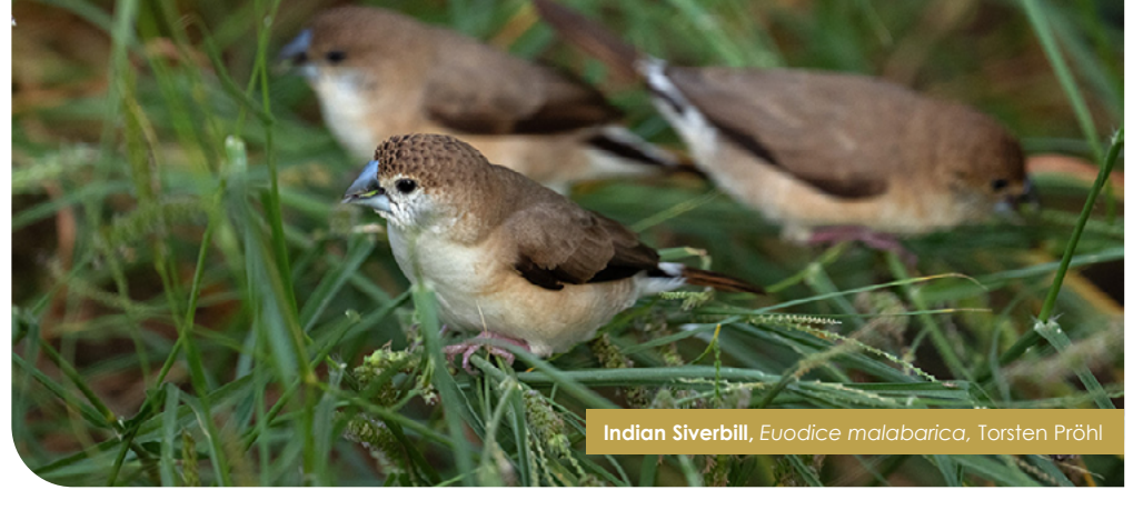
Indian Silverbill, Eudice malabarica , Torsten Pröhl